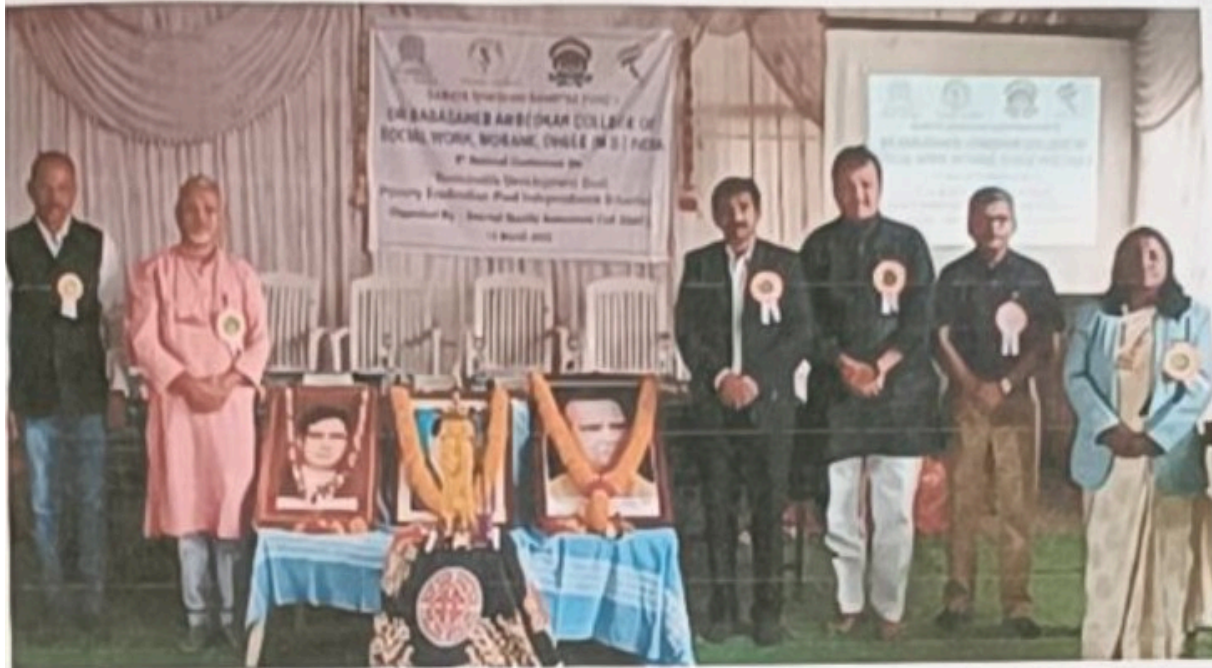
Inauguration of National Level Seminar on Sustainable Development on Poverty Eradication