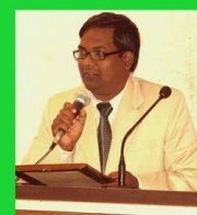
Adv. Bhupesh W. Patil Nagpur High Court, Nagpur