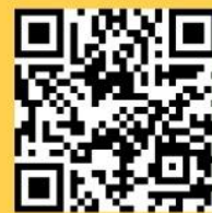
QR Code for Registration