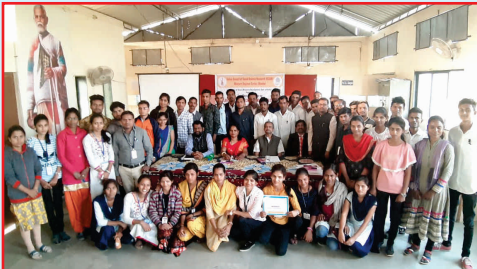
◀◀ ICSSR, Western Regional Center Mumbai Sponsored two days workshop on "Life Skill Education for Schedule Tribe Students" Dated : 30 & 31 st Jan 2019

▶▶▶ Study Tour Visit to Sane Guruji National Memorial Mangaon, Dist Raigad Feb - 2019