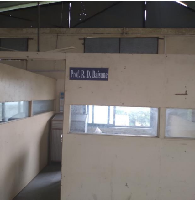
STAFF ROOM/ CABIN