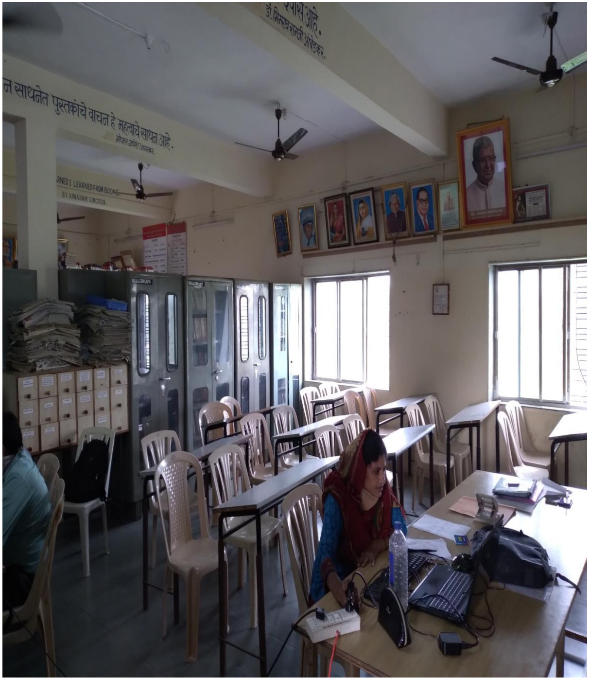
READING ROOM IN LIBRARY