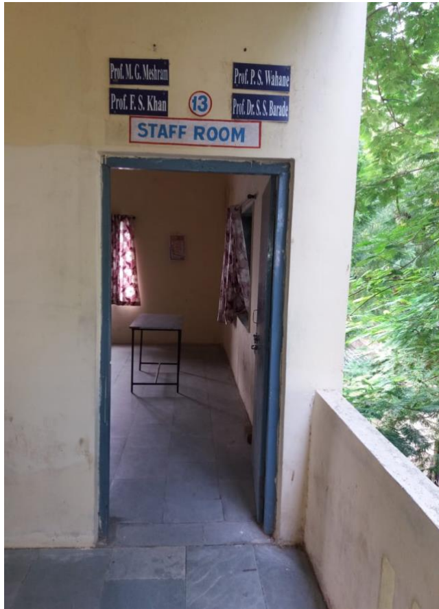
Ladies Staff Room