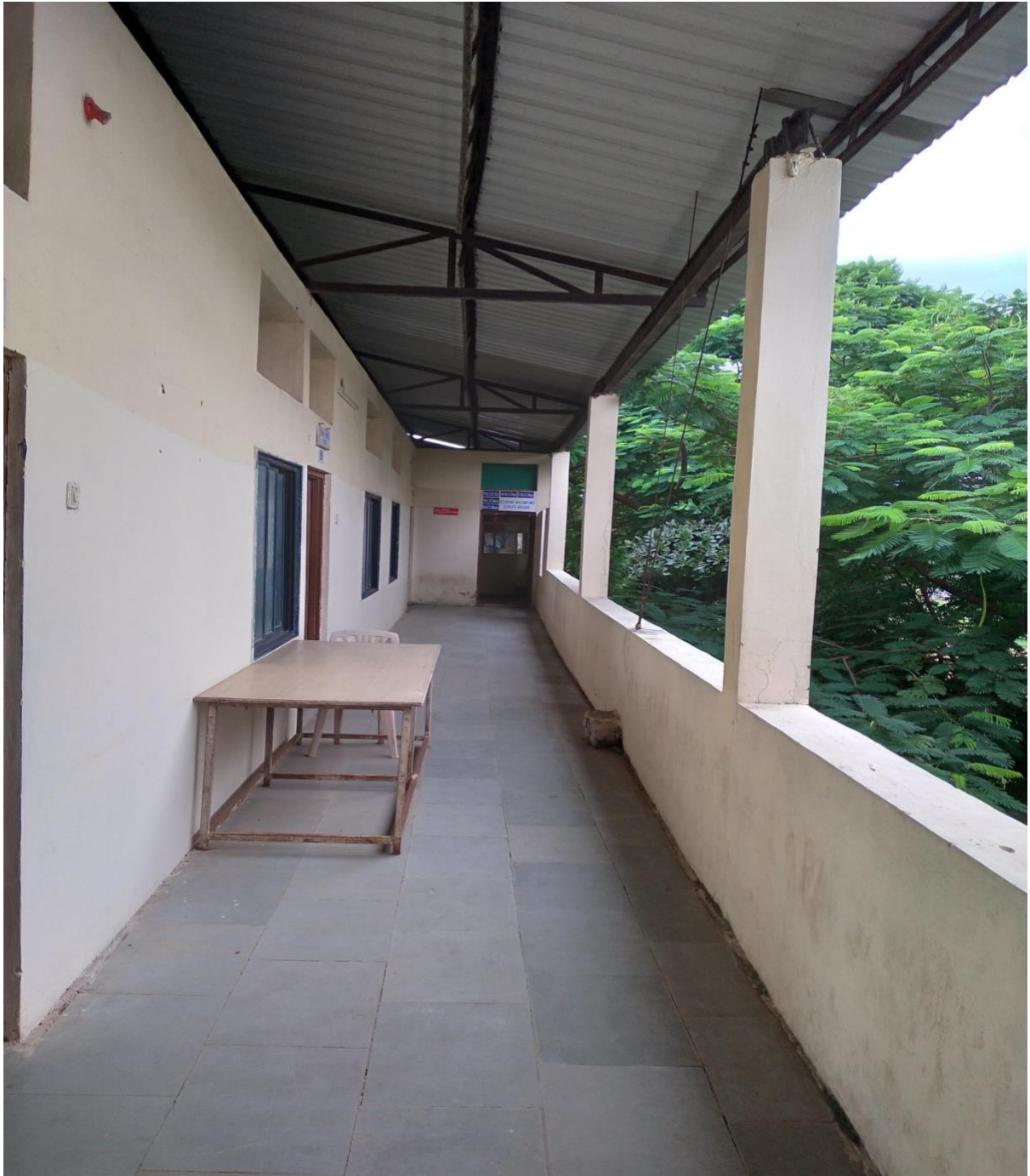
PASSAGE III FLOOR