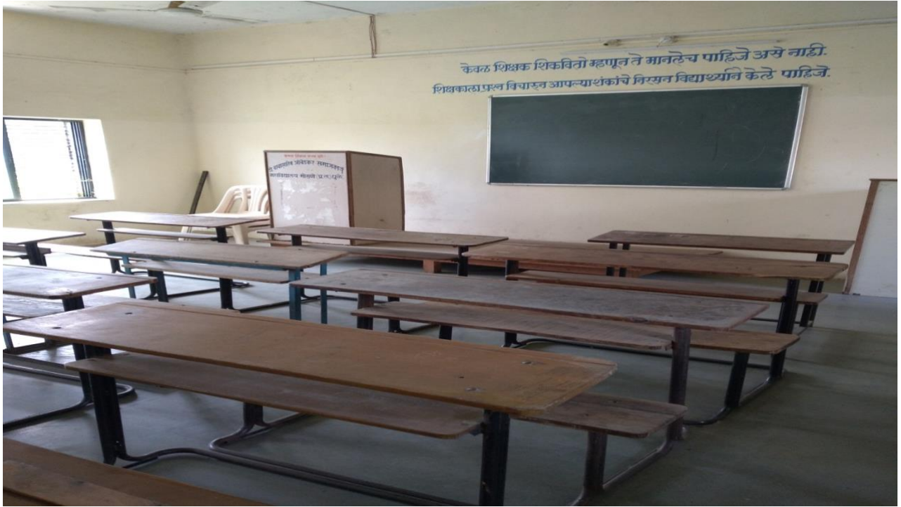
MSW II- CLASSROOM -10