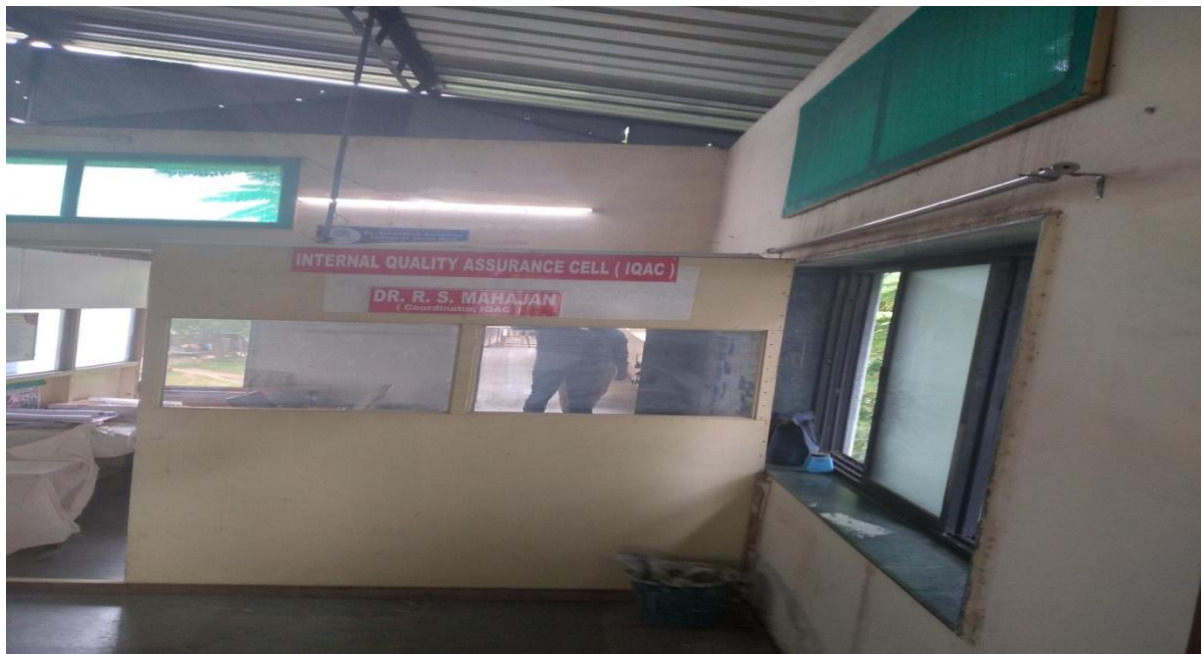
SOME FACULTIES FOR CABIN