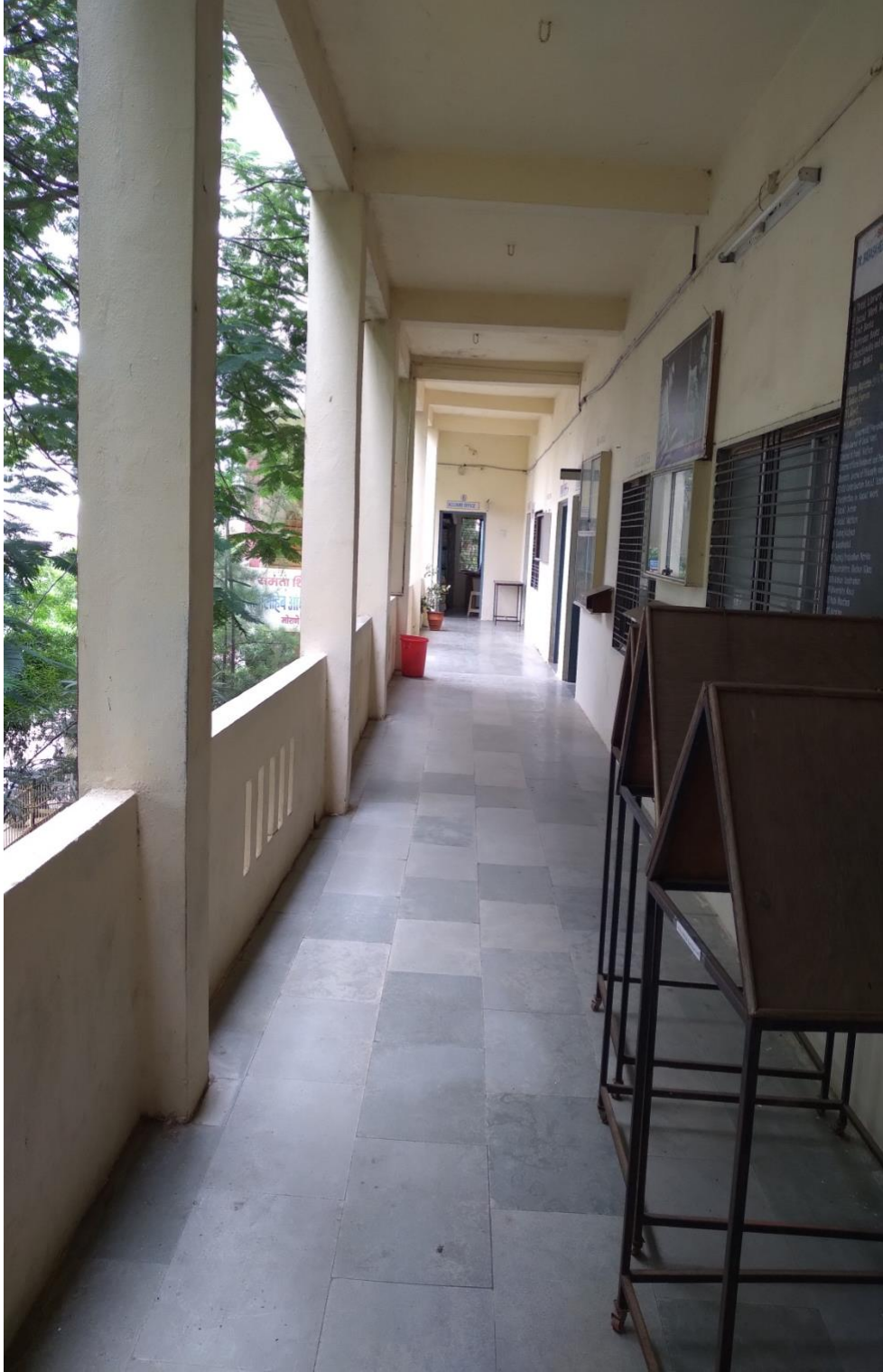
PASSAGE- II FLOOR