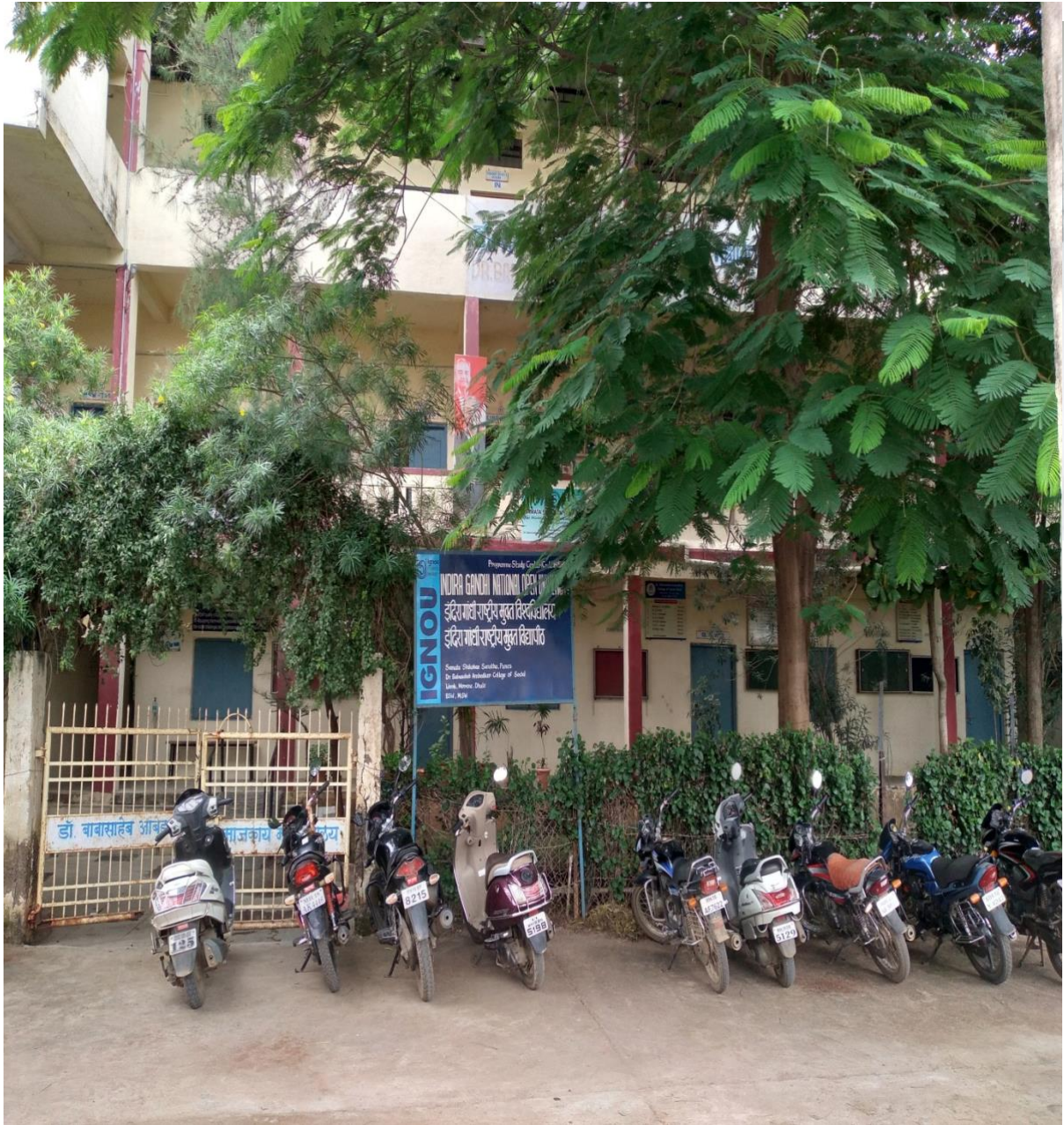
DR.BABASAHEB AMBEDKAR COLLEGE OF SOCIAL WORK.MORANE DHULE