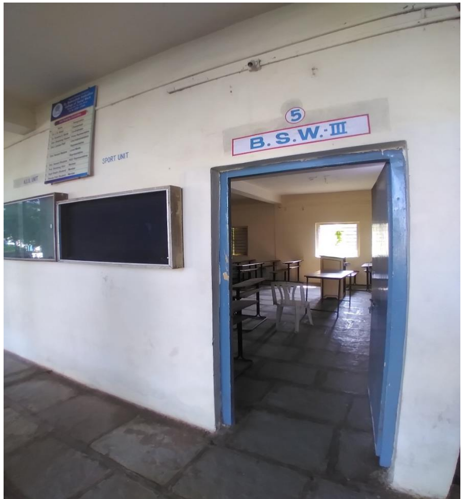
BSW III –ROOM- 5