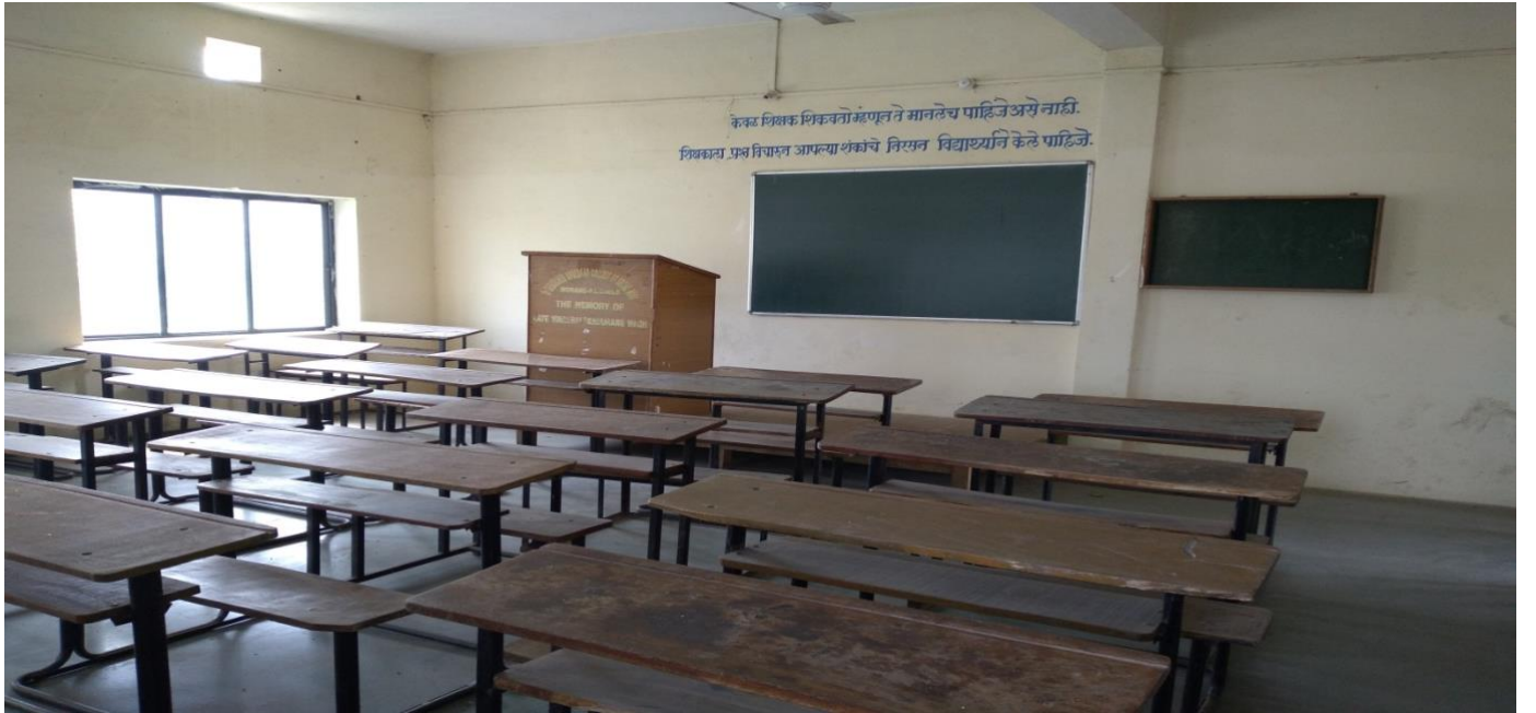
MSW I- CLASS ROOM- 9