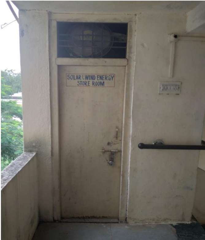
SOLAR WIND ENERGY STORE