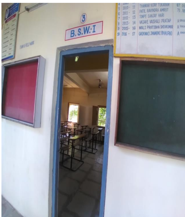
BSW I- ROOM NO -3