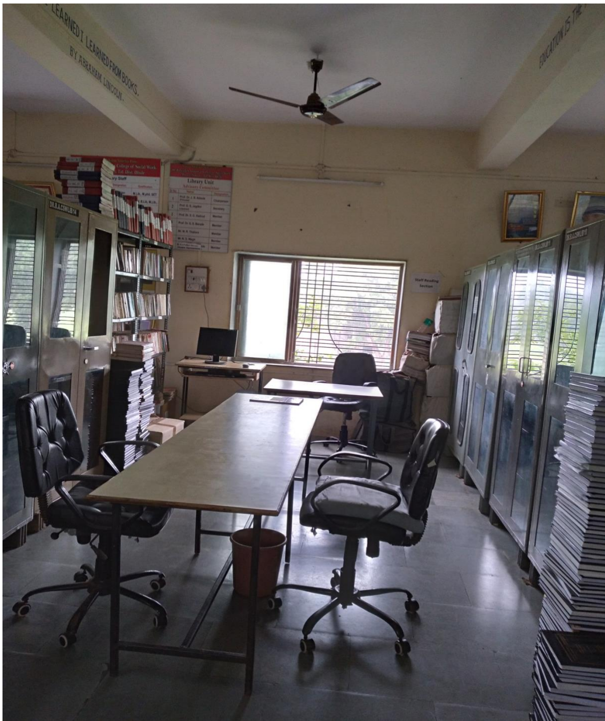
FACULTY CORNER IN LIBRARY