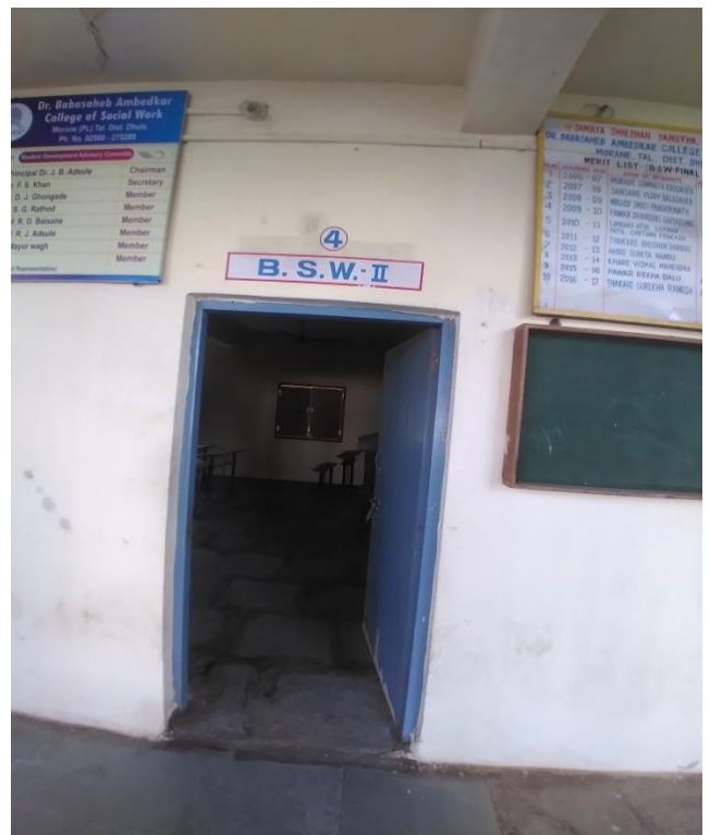
BSW II- ROOM -4