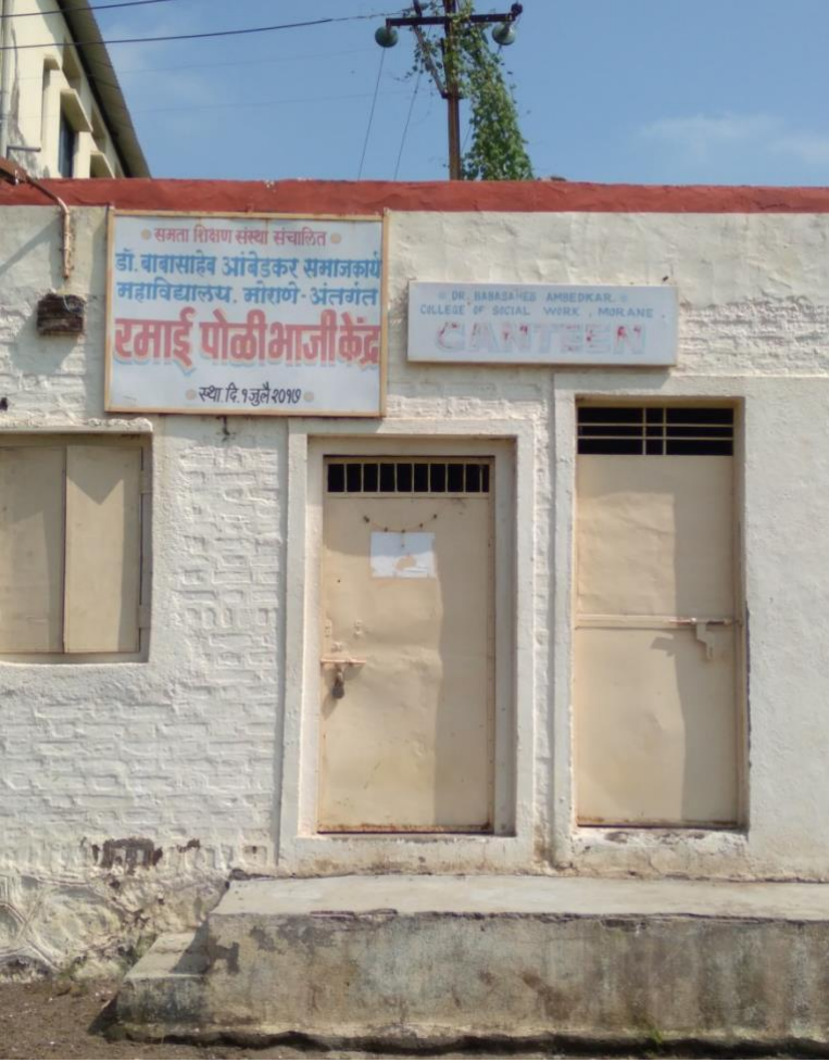
RAMAI POLI BHAJI CENTRE